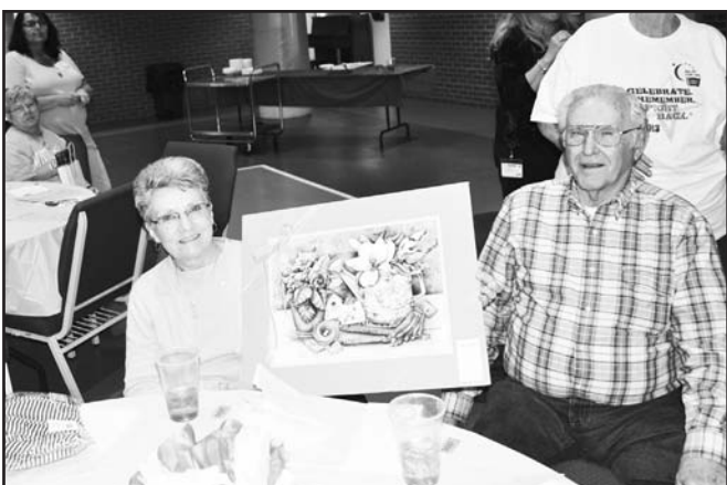
Door prizes were abundant at Thursday's Survivor Celebration.