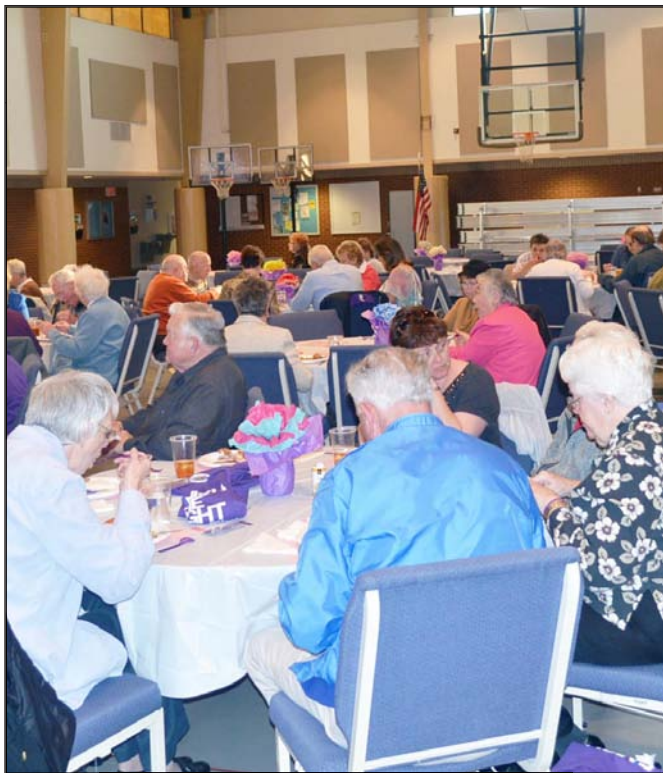
McConnell Memorial Baptist Church was packed Thursday evening as the Annual Relay for Life Survivor Celebration took place.